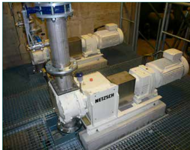
TORNADO® T1 conveying kaolin slurry

The self-priming TORNADO® pump operates via displacement, transporting the conveyor medium continuously from the suction to the pressure side using two intermeshing rotors. Almost all types of media can be transported smoothly in this way, from low-viscosity and high-viscosity materials such as thixotropic or dilatant substances to sticky and non-sticky or shear-sensitive materials. The pump also handles particle sizes of up to 3" / 70 mm with ease. The transported volume can be regulated easily via the rotation speed. Volumes of up to 4,402 gpm / 1,000 m 3 /h can be achieved depending on size.