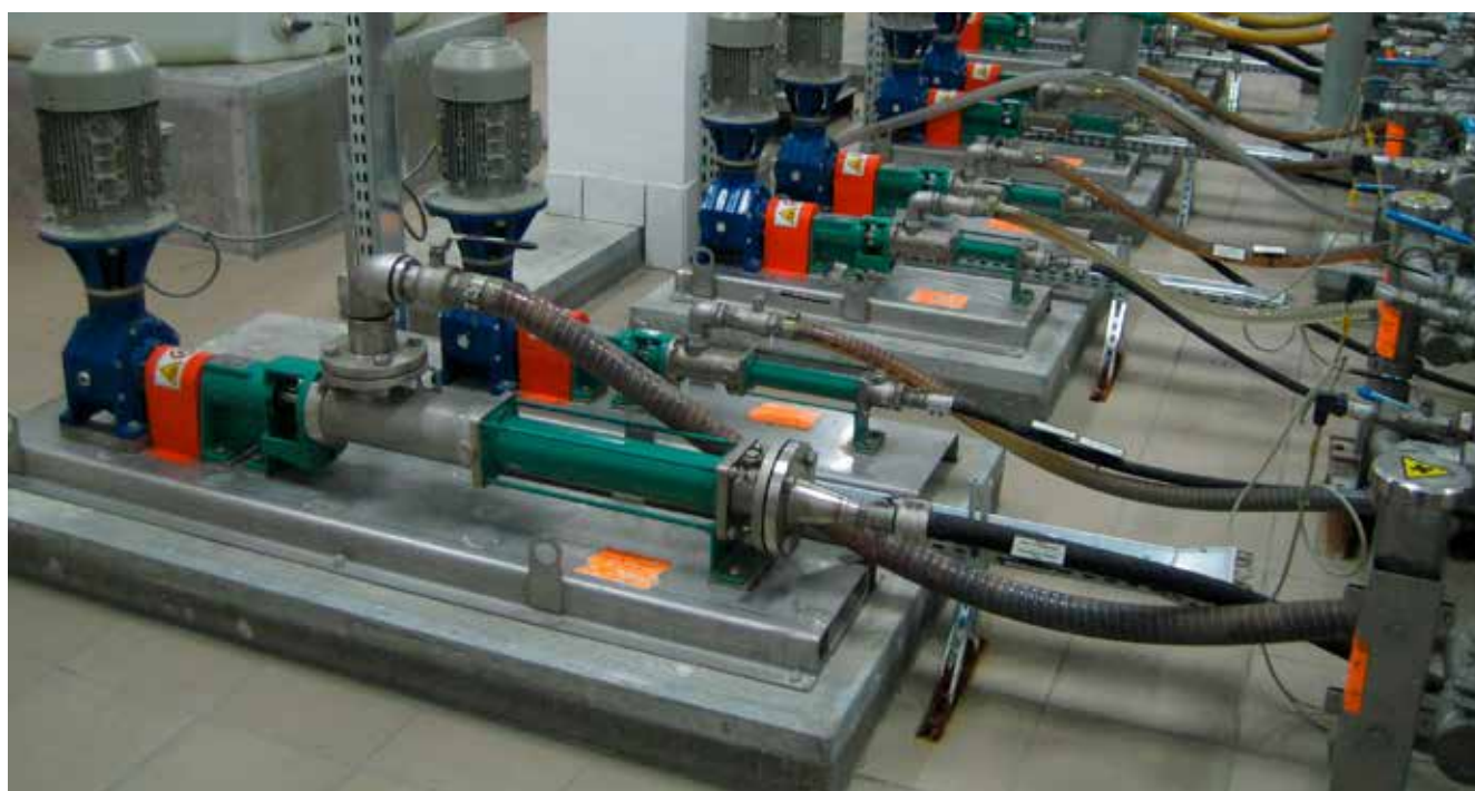
NEMO® pumps are conveying latex dispersions

In the petrochemical industry aromatic hydrocarbons contained in the pumped fluids cause problems quite often because such substances generate swelling of stators and joint seals. The use of suitable elastomers or stators made from solid materials in NEMO® progressing cavity pumps prevents swelling and guarantees the operational reliability of your plant.