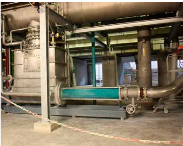
NEMO® pumps waste paper

In a Bavarian paper factory, the NEMO® progressing cavity pump technology is used for feeding a 9 ft. / 3 m wide screen belt inside of a concentrator. Around 220 gpm / 50 m 3 /h of the 131°F / 55 °C hot pulp, which has an abs. dryness (wood moisture) of eleven to twelve per cent, is evenly and continuously applied to the belt concentrator with 50 psi / 3.5 bar. After this dehydration process, surplus waste paper, which cannot be immediately processed, is brought to another production site with spare capacity. At this point the waste paper is almost dry with 42% abs. dryness and is loaded onto a truck using a wheel loader. Thanks to the smooth conveying principle, valuable waste paper is retained in phases of overproduction and put to further reasonable use.