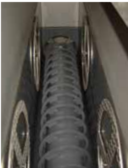
Hopper is customizable, spoked wheels have diamond plate surface