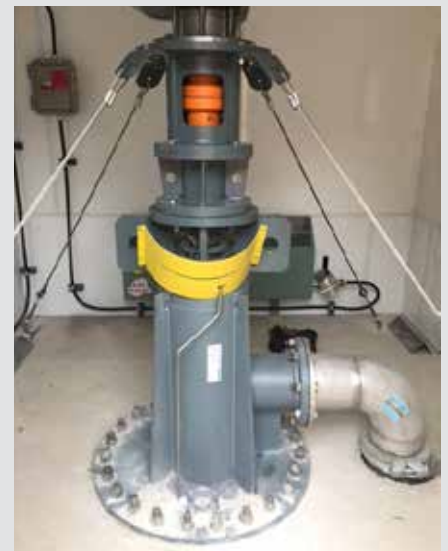
The NETZSCH BT vertical pump has reduced loading time to 17-20 minutes and while allowing increased solids content.

Reliability is a key factor in this application. The pump is operated intermittently,