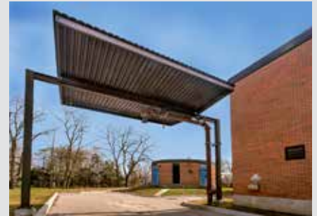
The customer used a submersible pump to transfer grade A fertilizer to the truck loading area.

Solutions to challenging problems are the hallmark of success for NETZSCH. This is another example of the high quality products and years of outstanding experience and expertise of NETZSCH combining to provide performance and cost savings to the customer.