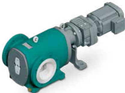
N.Mac® 50l Horizontal design