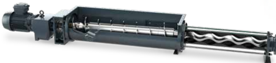
NEMO® B.Max Mixing Pump