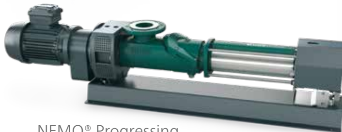
NEMO® Progressing Cavity Pump