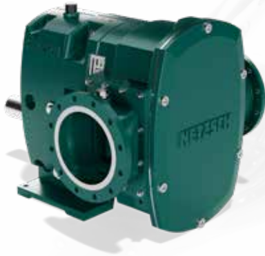
TORNADO® Rotary Lobe Pump