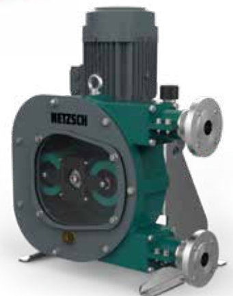
PERIPRO® Peristaltic Pump