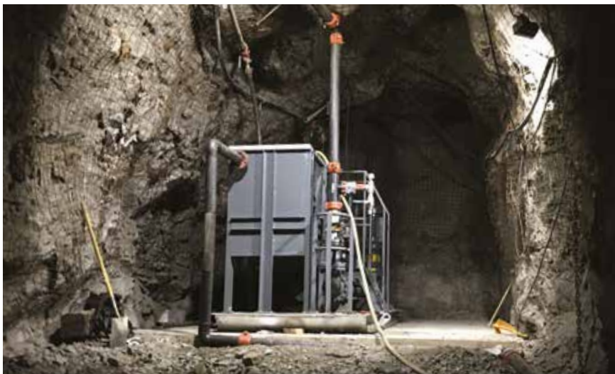
NETZSCH Mine Dewatering Unit for a gold mine in Montana, USA

Individual pumps are available to retrofit your existing skid.