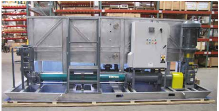
Design of the basic unit with customized controls for a mine in the midwest USA

The base unit includes a tank, progressing cavity pump with right angle gearmotor, inspection ladder, valves, and piping all mounted on a common galvanized steel skid. NETZSCH can optionally provide a unit with a control panel (with or without VFD on a removable stand) and instrumentation such as high/low level switches for the tank or dry run protection for the pump.