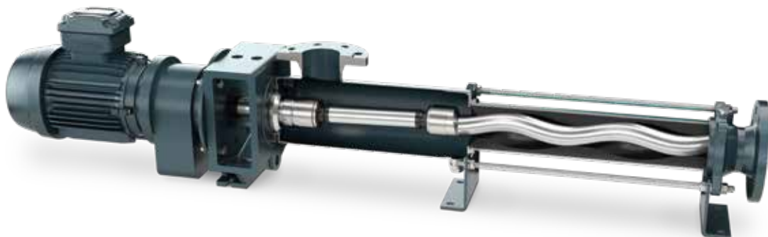
NEMO® BY pump in Block design with L geometry