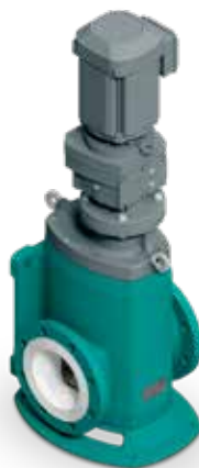
N.Mac ® 50l