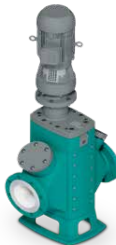
N.Mac ® 150l