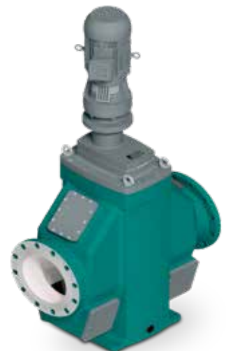
N.Mac ® 350l