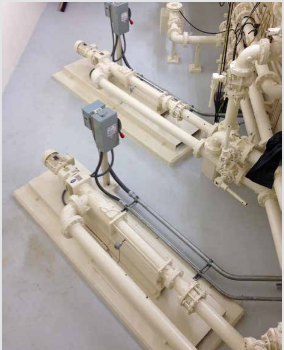
NEMO® BY progressing cavity pumps for belt filter press feed.

The District had several issues with the existing conveyor system. The first issue is the difficulty in moving the sludge cake to more than one location. Trailers are 30 or 40 feet