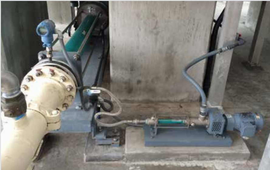
Polymer injection - NETZSCH FLR system reduces friction losses

reduction (FLR) system, which consists of a small NEMO® progressing cavity pump that injects a layer of polymer along the inner diameter of the pipe which allows the sludge to move more easily.