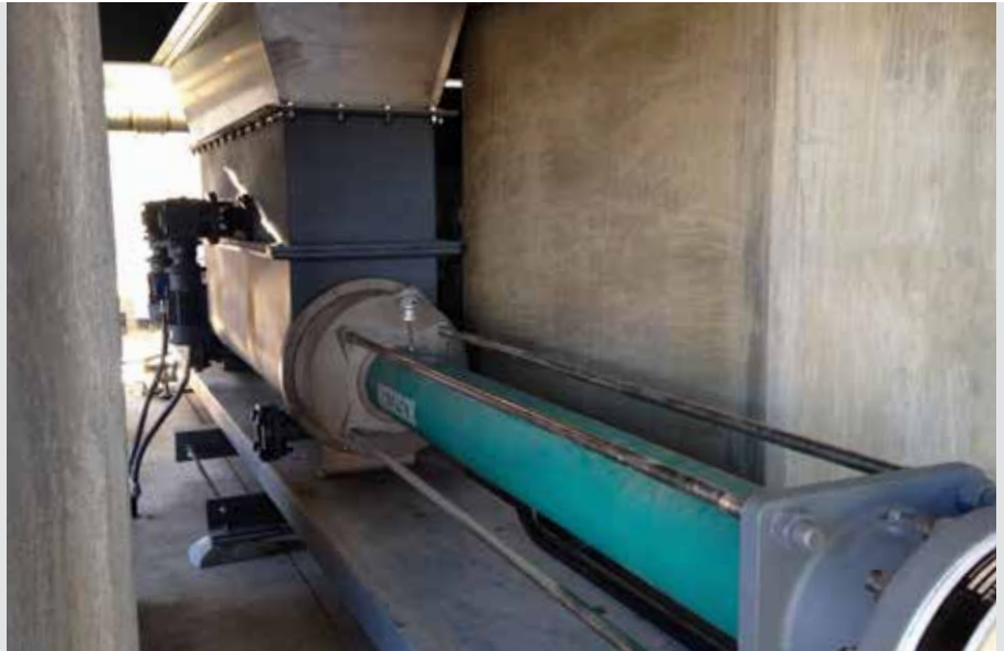
District ultimately selected the NEMO® SF Sludge Cake Progressing Cavity Pump

The equipment was delivered and the installation was completed, with facility