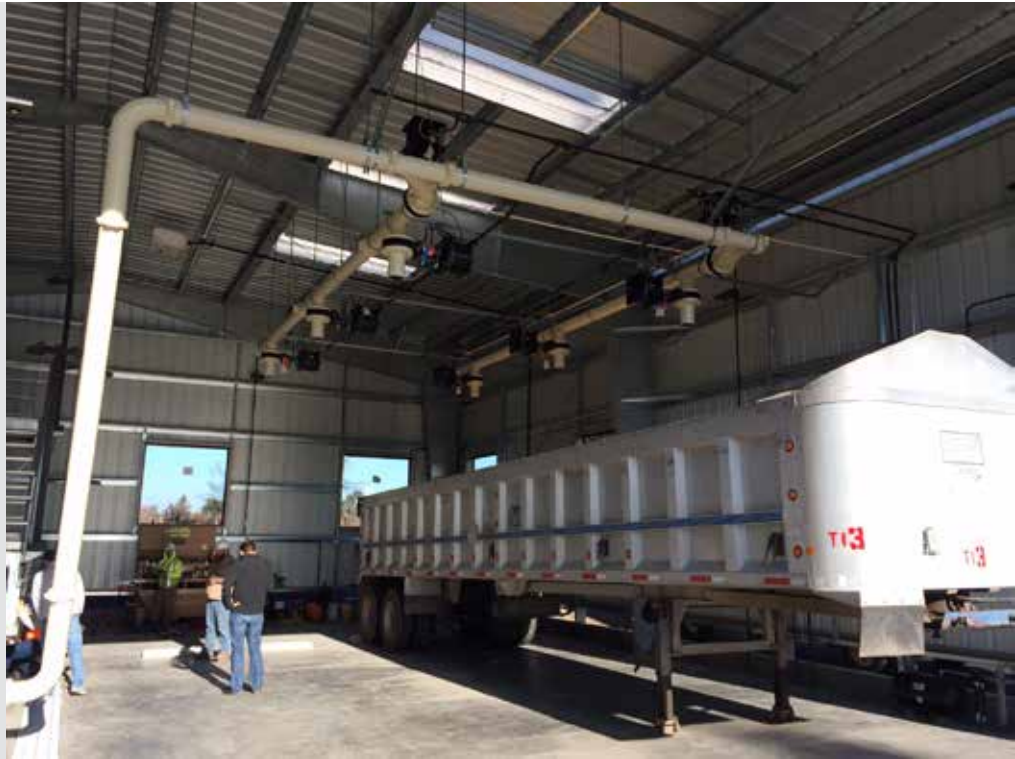
Even distribution of sludge into trailer

After considering these issues, the District selected progressing cavity pumps as the preferred option for transporting the sludge cake. Working with local pump distributor Flo-Line Technology, the District sought to take advantage of NETZSCH's